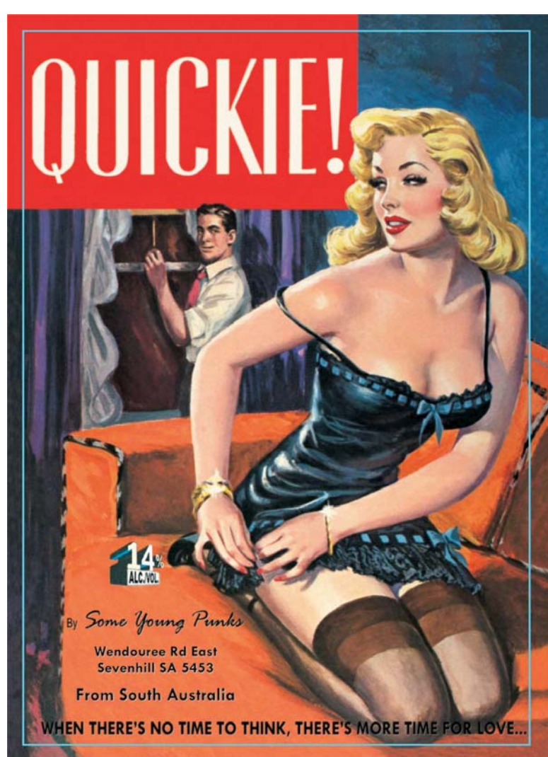
Image Type: Brand (front) Actual Dimensions: 4.00 inches W X 3.00 inches H

AFFIX COMPLETE SET OF LABELS BELOW Image Type: Back Actual Dimensions: 4.00 inches W X 5.50 inches H